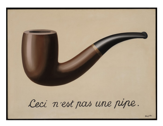
Figure 3: René Magritte's La trahison des image, (1929)<sup>3</sup>.

Foucault takes an interest in the calligram format as it relates to René Magritte's well known work La trahison des images [ Ceci n'est pas une pipe ] (The Treachery of Images [This is Not a Pipe]), 1929. His argument is that La trahison des images is a preserved, unraveled calligram (1983).