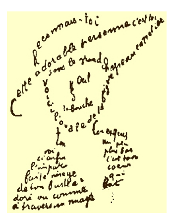
Figure 2: Calligram by Guillaume Aplollinaire, date estimated early 20th century.

Michel Foucault writes in This is not a pipe that the calligram is text written or drawn in a shape where both the text is readable and the shape is recognizable. Any related interplay of text to shape is defined by the creator of the calligram, although often the intent is that there is a symbiotic relationship between the two that enhances reflexive and recursive reading and viewing. See figure 2^2 for an example calligram.