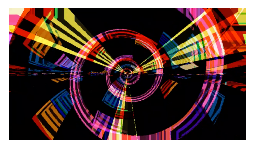
Figure 8: Screenshot of Ryan Ross Smith and Shawn Lawson performing EV9D9 (2017) at the GENERATE! Festival with Tidal Cycles and GLSL in The Dark Side IDE

works. To the right side of the screen are several windows that provide Text-Annotations regarding the consumption of various processes on the CPU, and below the Text a string of Text-Annotations that provide information on the state of TidalCycles. To the left is a chat window that indicates who has logged into the livestream, who has left, and who might have something to say while they are present. This too is a Text-Annotation and the heart emoji is a Graphic-Annotation, but like the Text-Annotations along the right side of the screen, these Text-Annotations are only tangentially related to the live-coding happening in the center. Yet, given that they are included in the Image, they contribute to the Image as a whole. Similarly, the application icons along the top edge of the screen are within the Image, yet their functional independence from the Text renders them Interface-Graphic. This particular Image could be described as containing Text, Text-Annotation, Graphic-Annotation, and Interface-Graphic.